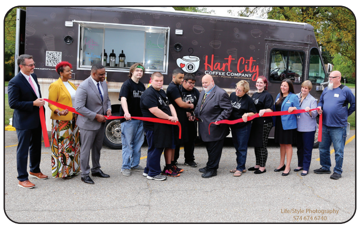
Elkhart Community Schools launches a new coffee truck for Hart City Coffee Company, a non-profit organization run by ECS Young Adult Program students. The program serves individuals ages 18-22 who have disabilities and is an extension of traditional Special Education programming. www.elkhart.k12.in.us