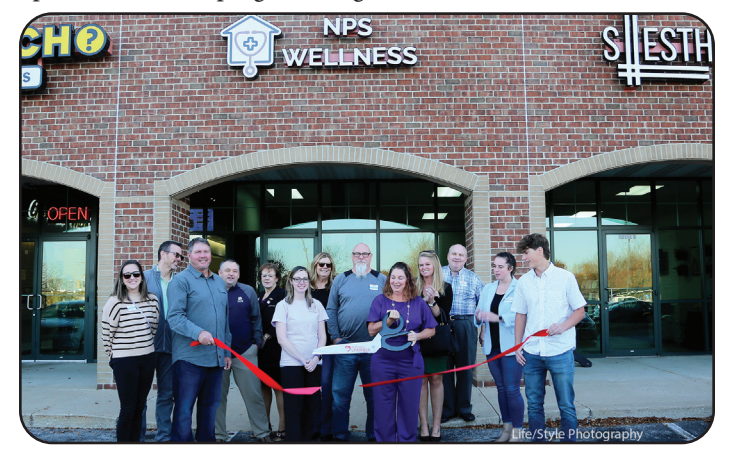
NPS Wellness celebrates their Grand Opening at 5230 Beck Dr, Ste 3, Elkhart! NPS Wellness specializes in weight loss and hormone treatment, medical care and aesthetic services. www.npswellness.com