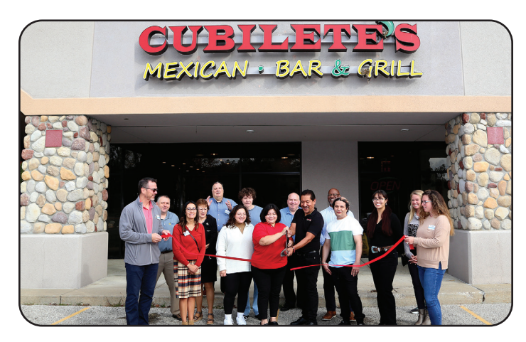
Celebrating new member Cubilete's Mexican Bar & Grill, 4100 E Bristol St, Ste 1, Elkhart! Their menu is inspired by the cuisine of the State of Guanajuato and surrounding regions. cubiletesmexicanbarandgrillin.com