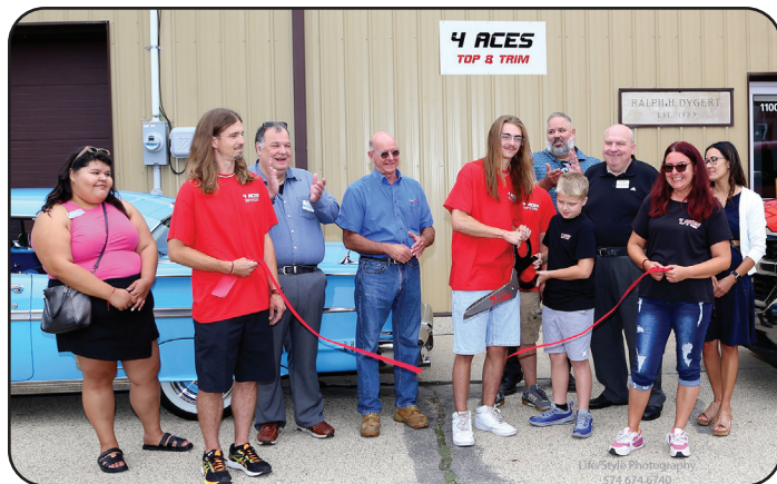
4 Aces Top & Trim celebrates the opening of their new business at 1100 Canton St, Elkhart. They provide custom upholstery work for boats and cars. www.facebook.com/people/4-Aces-Top-Trim/61562700464405/