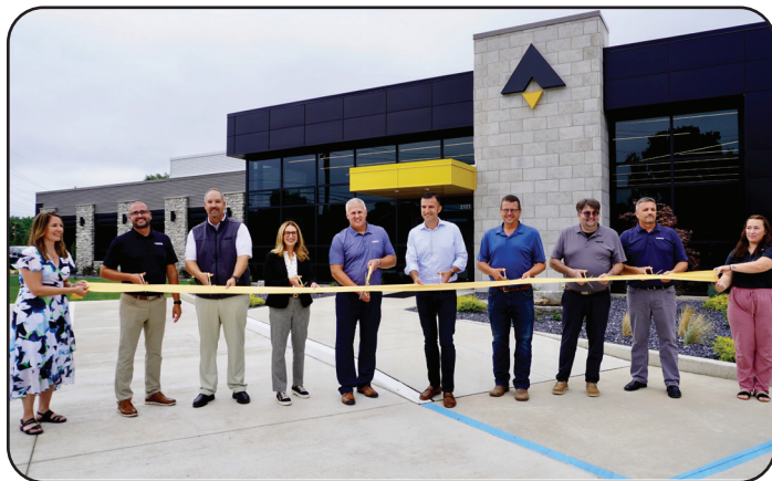
Congratulations to Ancon Construction on their beautiful new facility at 2121 W Wilden Ave, Goshen! What a great way to kick off the celebrations for their 50th Anniversary! www.anconconstruction.com