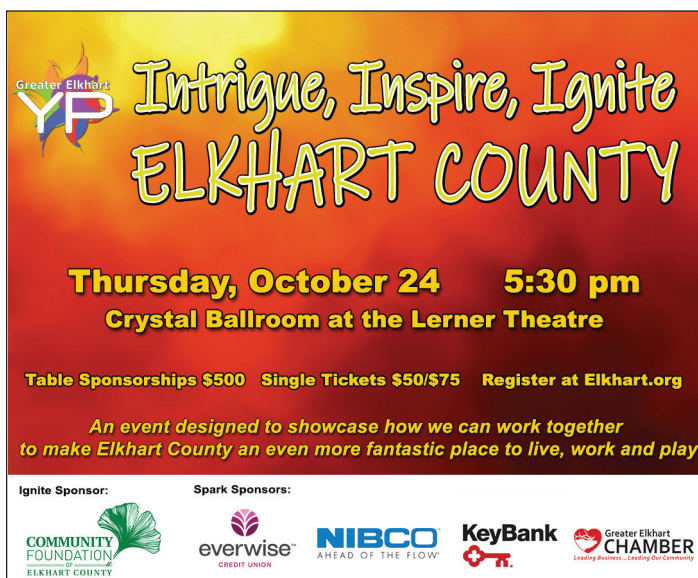
Table sponsorships and individual seats are available. Register at Elkhart.org .

The event begins at 5:30 pm with networking. Dinner will be served at 6 pm, and the program will begin at 6:45 pm.