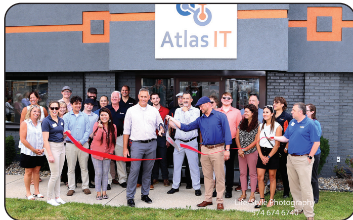
Atlas IT is open in their new location at 410 N Main St, Middlebury. Atlas IT helps your business by providing the talent, knowledge, and systems to keep your technology humming. www.atlasit.org