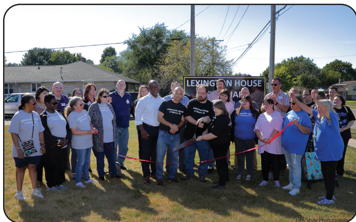
Congratulations to Lexington House on the grand opening of their new location at 311 W Hively in Elkhart. Lexington House is a place to rebuild your confidence and resilience for your mental health wellness journey. www.lexingtonhouse.org