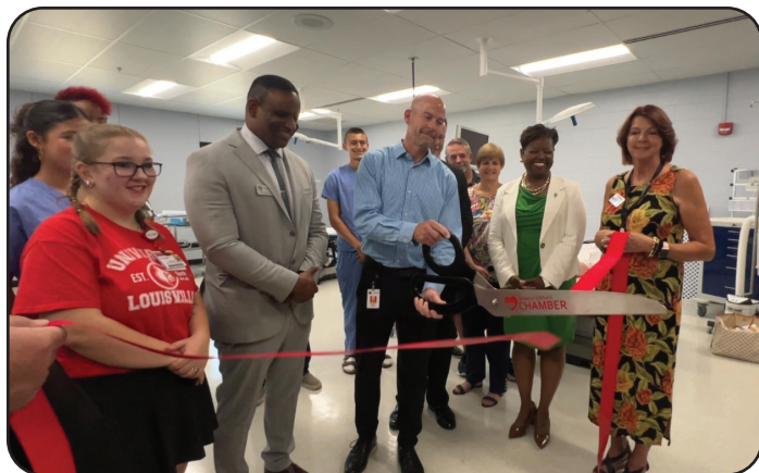
The Surgical Tech Program renovations at the Elkhart Area Career Center are complete! This joint project between EACC and Ivy Tech Community College brings valuable training for high school and adult learners. eacc.elkhart.k12.in.us