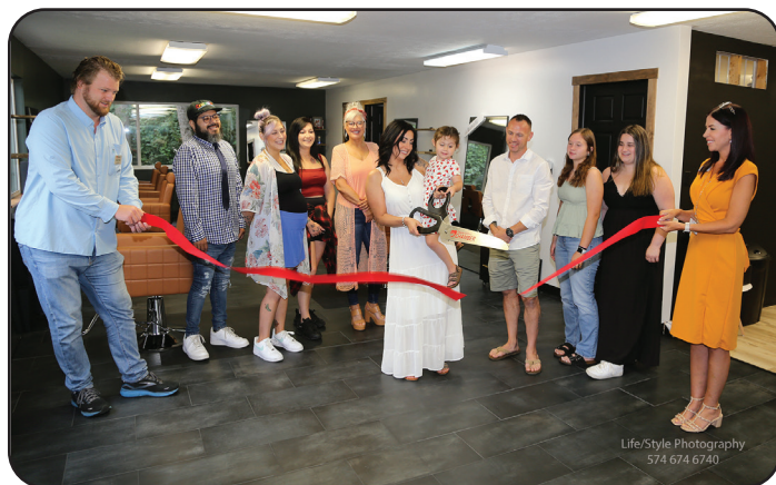
Trim & Tonic celebrates the grand opening of their Barber Salon located at 1789 E Bristol St, Ste B, Elkhart. Trim & Tonic is the only Barber Salon you will find in this area with options for both him and her, www.vagaro.com/trimandtonic