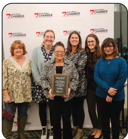
Communications Write Connections | strategy + design, LLC

Bridge the gap for minority entrepreneurs by connecting them to valuable resources, connections and opportunities that may empower them to create and/or expand their own business(es)