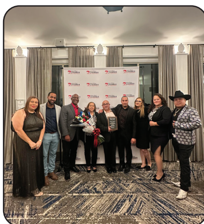
Restaurant Ricky's Taqueria