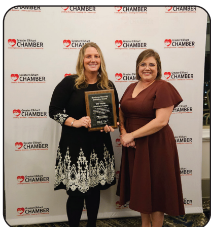
Nonprofit Leadership DW Victim Advocacy Center