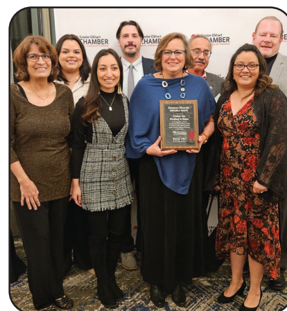
Health Center for Healing & Hope