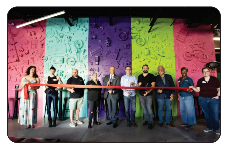
The Garage Arcade Bar relaunches the new space and design at their "Super Mega Ultra Grand Reopening Expansion Pack" celebration with friends, good vibes and live music. GarageArcadeBar.com